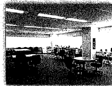
JICA Plaza Tohoku