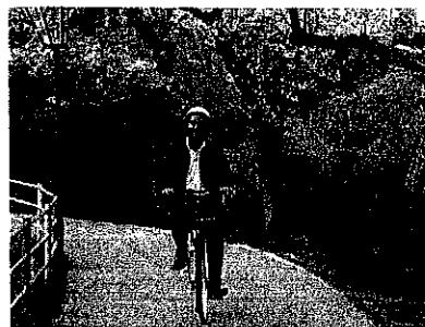
Cycling under Cherry Blossoms