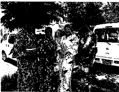
In Traditional Japanese Costumes

It is recommended that each participant bring some ready-made or prepared foods if you have any diet restrictions. There are limited places to buy halal or vegetarian foods in Japan.